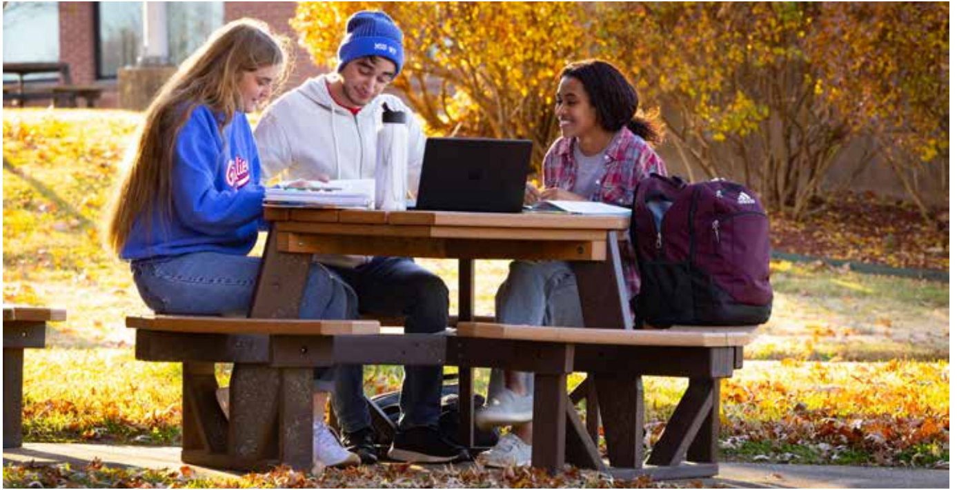
A new program at MSU-West Plains increases resources for perspective college students who have autism.